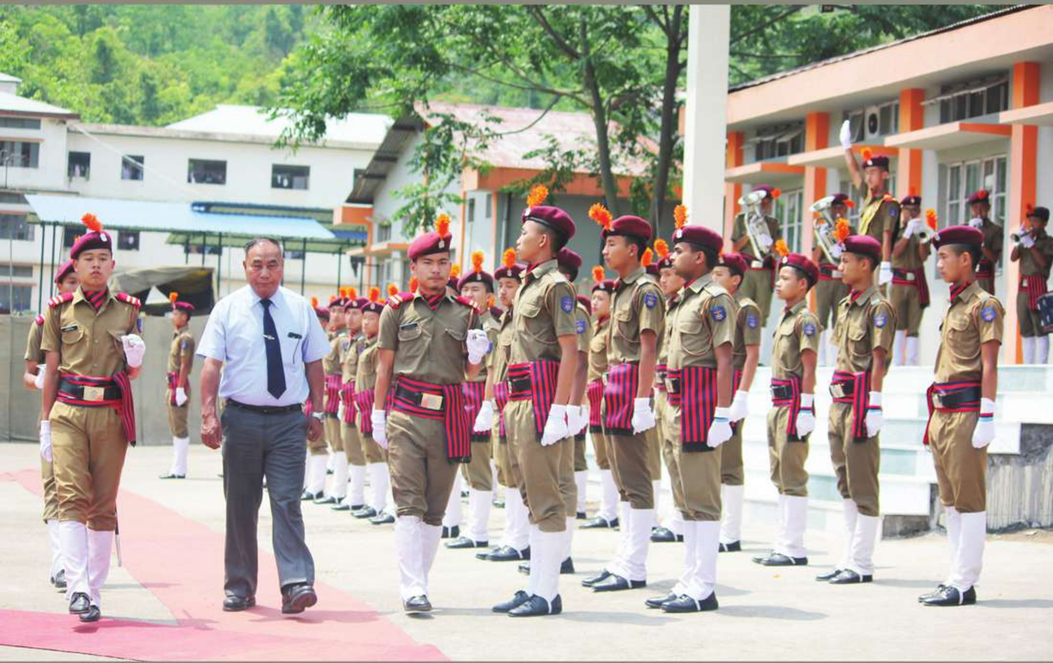
Shri L L Doungel, IPS, DGP, Nagaland reviewing the Guard of Honour on 10th Founders Day